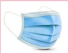
Blue surgical masks