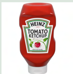
CONDIMENT SQUEEZY BOTTLES