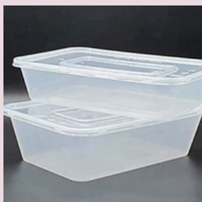
PLASTIC TAKEAWAY CONTAINERS