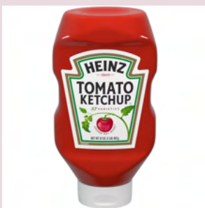
CONDIMENT SQUEEZY BOTTLES