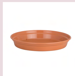
PLASTIC PLANT POT SAUCERS