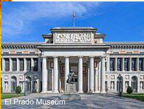
El Prado Museum