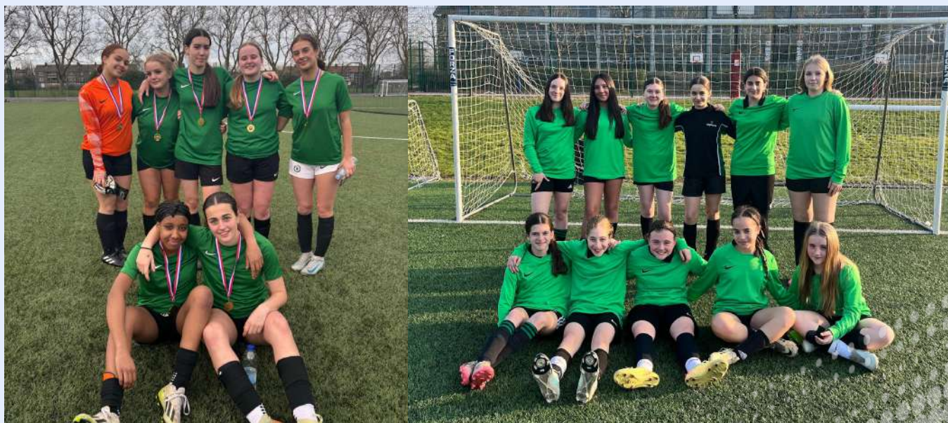
Senior girls Borough Champions and Year 7 & 9 Enfield League finalists