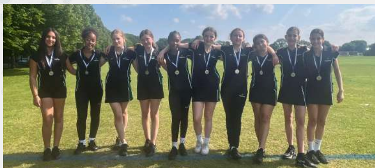
Year 8 Enfield Borough Rounders Runners-up