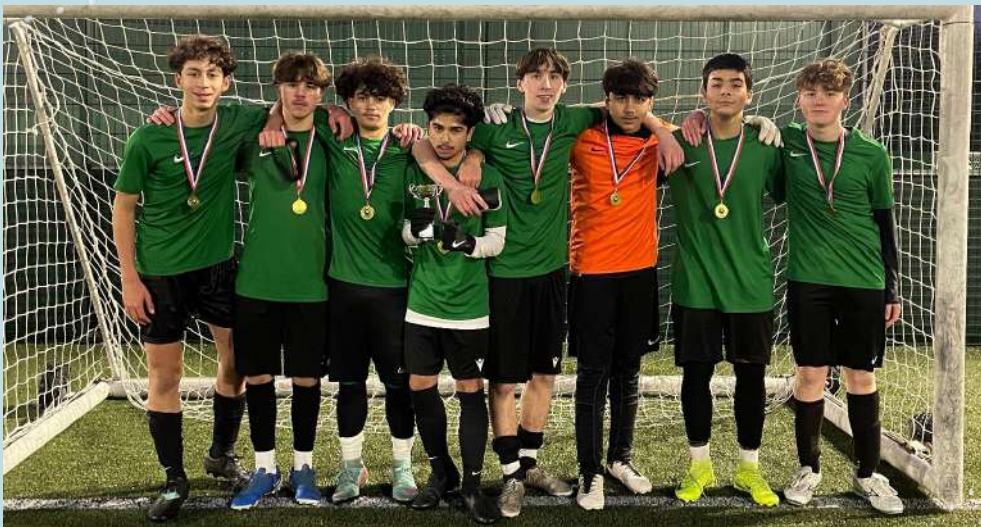
Year 10 boys' 7-a-side tournament winners and Enfield Cup semi-finalists