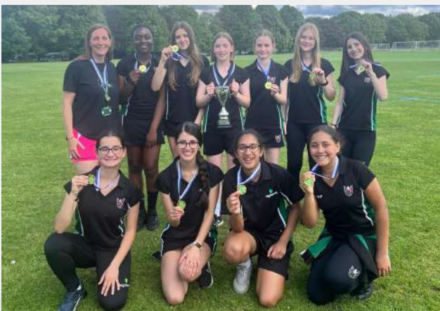
Year 9 Enfield Borough Rounders Champions

Meanwhile, our year 8 girls had a fantastic tournament, finishing as Enfield Borough runners-up. The combined year 7 and 8 rounders team also impressed, narrowly missing out on a place in the final after a close semi-final against Wren Academy, but still securing a brilliant 3rd place overall. Well done to all the players on an excellent season!