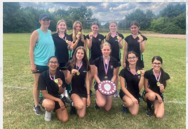
Year 9/10 Enfield Rounders League Champions