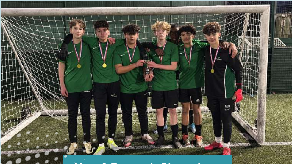
Year 9 Borough Champions

Here at Highlands, both our girls' and boys' football teams continue to thrive with impressive success. The year 9 boys were crowned 7-a-side tournament winners. We also took home the title in the year 10 boys' 7-a-side tournament. In addition, both the year 10 and year 11 boys' teams reached the semi-finals of the Enfield Cup - an outstanding achievement that reflects their hard work, teamwork, and determination.