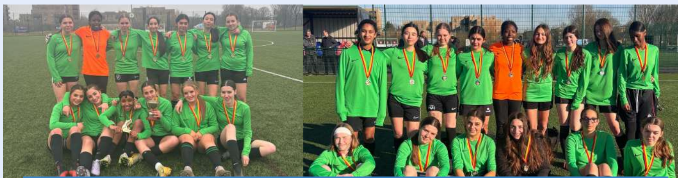
U16 Middlesex Football Champions and U15 Middlesex Cup finalists

Our successes continue with our incredible girls' football teams. This year, they were crowned U16 Middlesex Football Champions and were finalists in the U15 Middlesex Cup. Our senior girls' team, made up of years 11, 12, and 13, were also named Borough Champions. Meanwhile, our year 7 and 8 girls impressed as Enfield League finalists. A fantastic set of achievements that reflect the talent, hard work and dedication across all age groups.