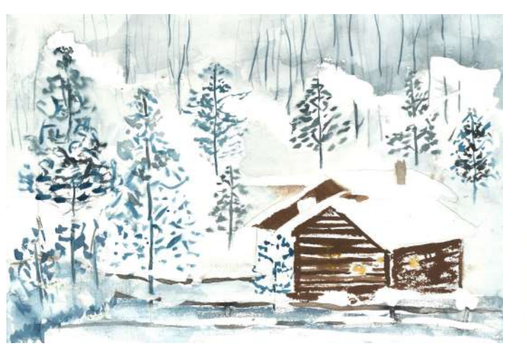
2nd: Oliver Mere 70DM