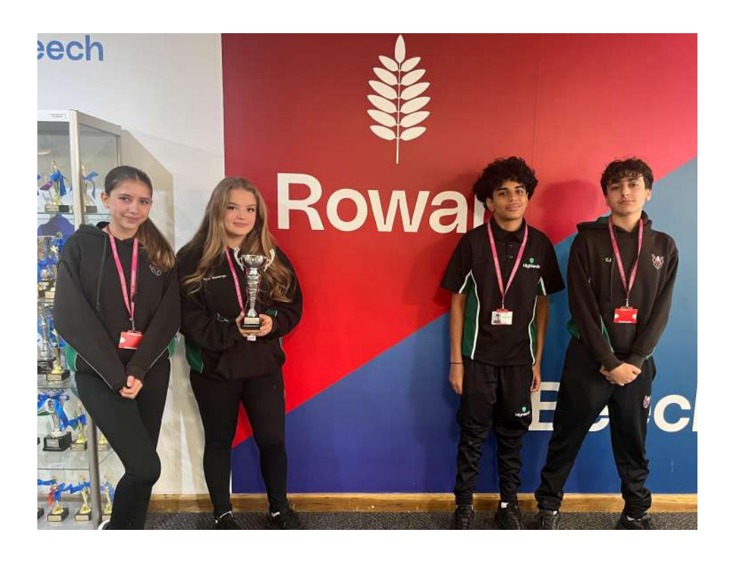
Year 10: 1st Rowan, 2nd Willow, 3rd Oak and 4th Beech