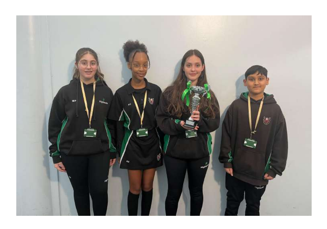
Year 8: 1st Willow, 2nd Beech, 3rd Rowan and 4th Oak