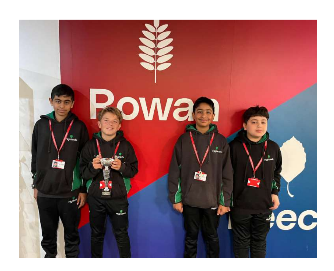
Year 7: 1st Rowan, 2nd Oak, 3rd Willow and 4th Beech