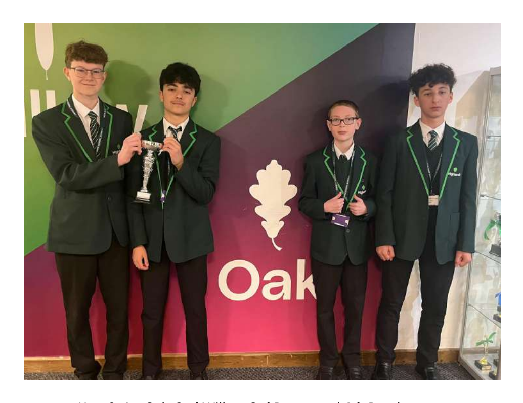
Year 9: 1st Oak, 2nd Willow, 3rd Rowan and 4th Beech