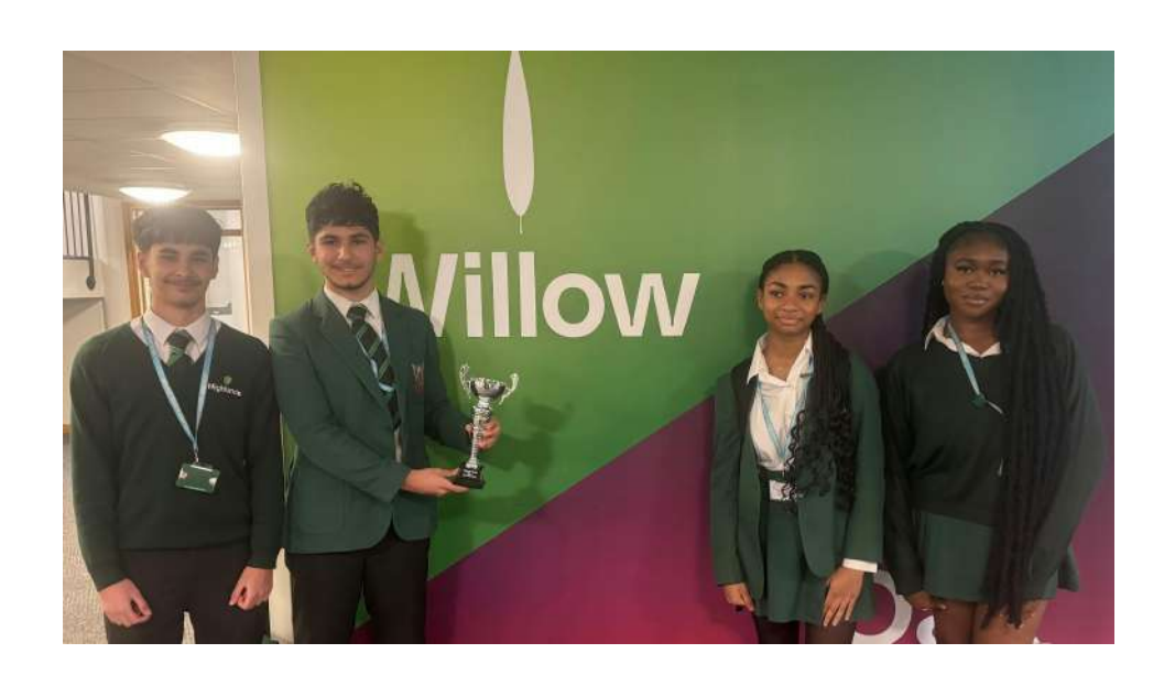
Year 11: 1st Willow, 2nd Beech , 3rd Oak and 4th Rowan