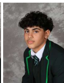
Players of the match