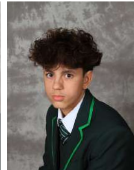
Players of the match