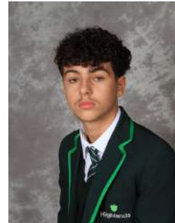
Player of the match