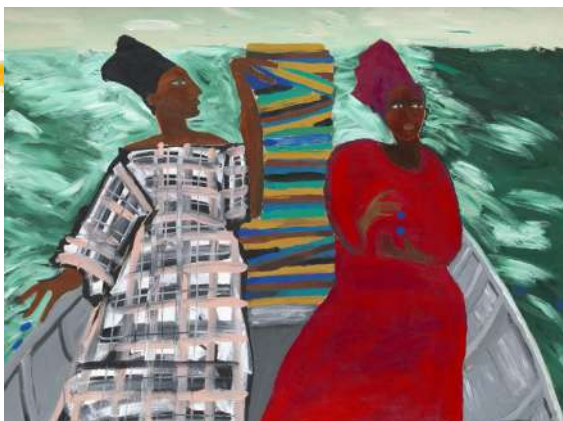
Between the Two My Heart is Balanced