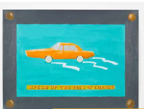
Speed Up the Pace of Change

One of Lubaina Himid's striking paintings, Between the Two My Heart is Balanced , shows two Black women sitting on a boat, tearing up newspapers and throwing them into the sea. The newspapers represent the stories that have been told about history - stories that have often left Black people out. By tearing them up, Himid powerfully suggests that Black women have the ability to reshape those narratives and ensure their voices are heard and remembered.