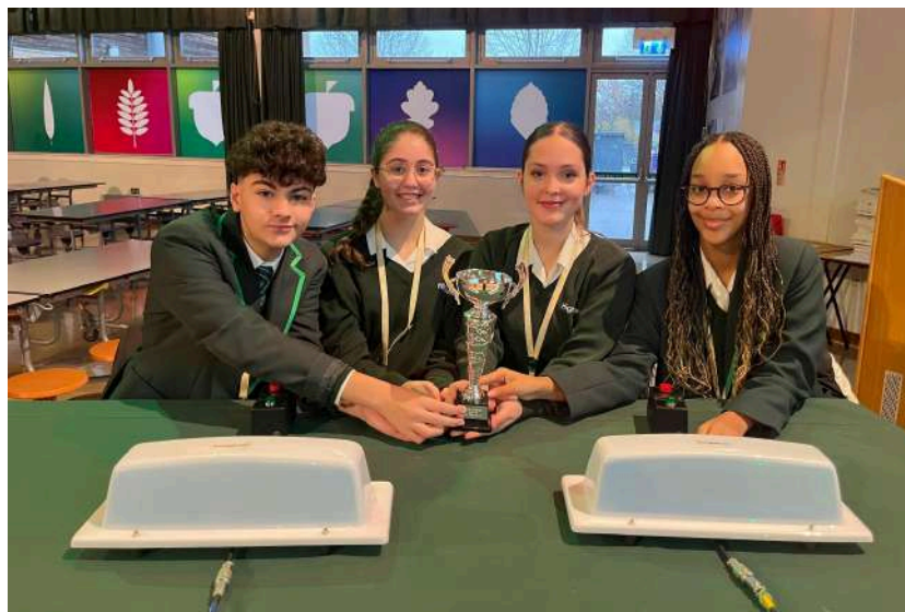
1st: Willow, 2nd: Rowan, joint 3rd: Oak and Beech