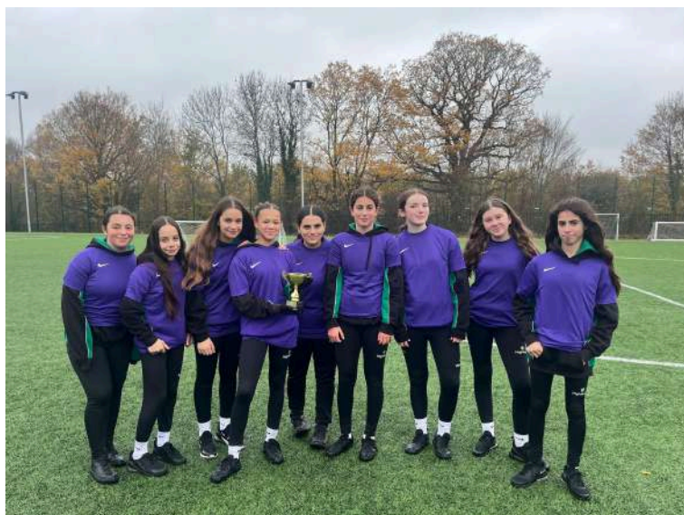
Girls: 1st: Oak , 2nd: Rowan , 3rd: Beech and 4th: Willow

The girls' inter house football final saw Oak secure a fantastic 3 - 0 victory over Rowan. Their dominant performance earns them the house points and the trophy - a brilliant achievement. Well done, Oak!