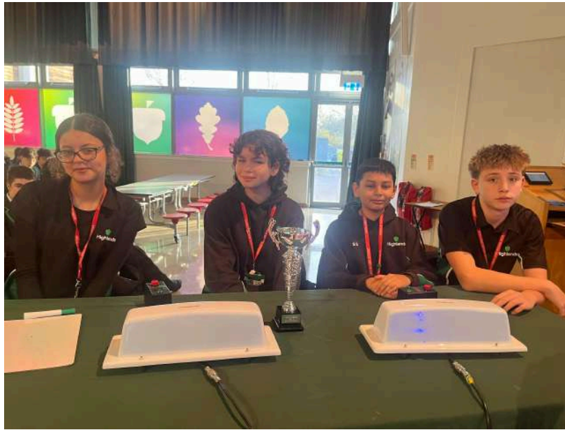
1st: Willow, 2nd: Oak 3rd: Rowan and 4th: Beech