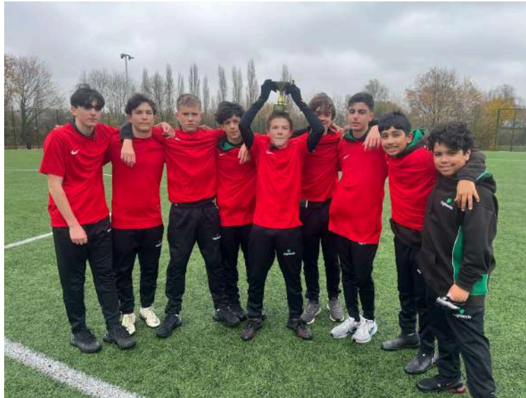
Boys: 1st: Rowan , 2nd: Oak , 3rd: Beech and 4th: Willow

The year 9 inter house football competition took place this week, ending in an exciting final where Rowan secured a 1–0 win against Oak. Their victory earns them 4,000 points and the trophy - well done, Rowan!