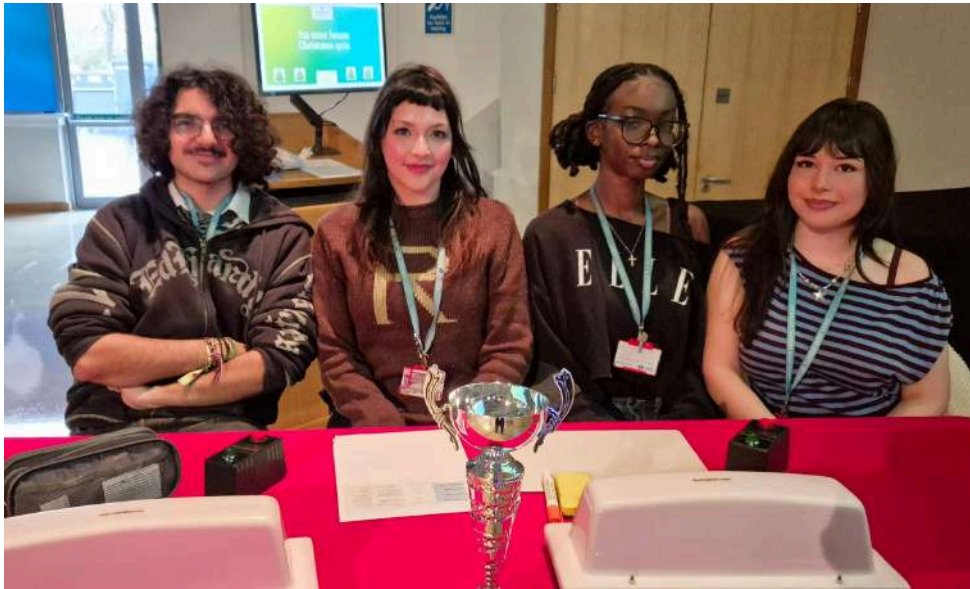
1st: Rowan, 2nd: Oak, 3rd: Willow and 4th: Beech